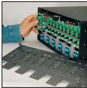
VX DIMMER WITH FRONT REMOVED

The VX Series dimmer provides front accessible control and dimming electronics. The MX dimmer provides unsurpassed reliability and state of the art technology combined to provide cost effective digital dimming. Versatile control input via USITT DMX-512 and optional analog along with self trimming, digital control electronics provide perfect dimmer output tracking from channel to channel.