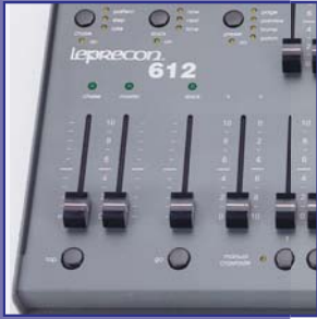
CUE STACK WITH GO BUTTON